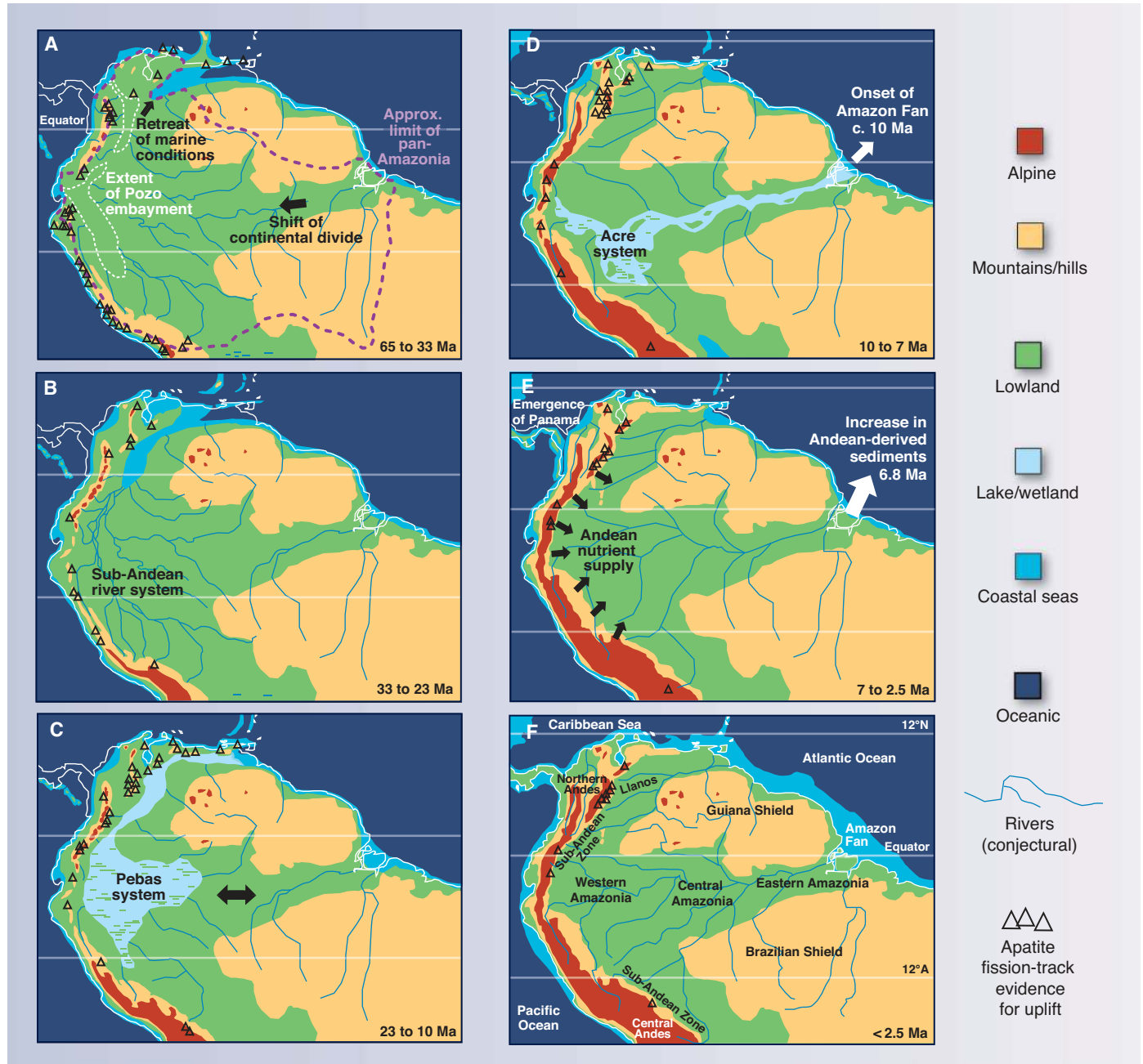
Fig. 1. Paleogeographic maps of the transition from “cratonic” (A and B) to “Andean”-dominated landscapes (C to F). (A) Amazonia once extended over most of northern South America. Breakup of the Pacific plates changed the geography and the Andes started uplifting. (B) The Andes continued to rise with the main drainage toward the northwest. (C) Mountain building in the Central and Northern

tectonic readjustments [(23); see also references in (16)]. Plate subduction along the Pacific margin caused uplift in the Central Andes during the Paleogene [65 to 34 Ma; see references in (14, 16)]. Posterior plate breakup in the Pacific (~23 Ma) and subsequent collision of the new plates with the South American and Caribbean plates resulted in intensified mountain building in the Northern Andes (figs. S1 to S4) (16). Mountain building first peaked in this region by the late Oligocene to early Miocene (~23 Ma), at an age