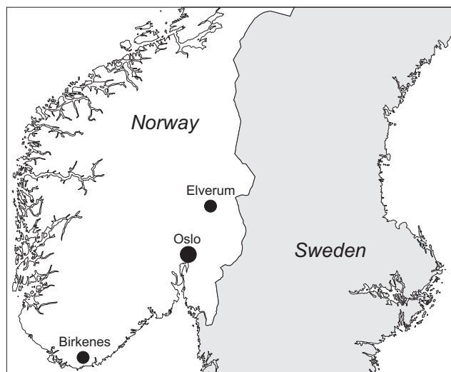
Fig. 1. Map of the southern parts of Norway including the location of the sampling sites Birkenes (rural background), Elverum (suburban), and Oslo (curbside and urban background).

et al., 1999; Mayol-Bracero et al., 2002; Graber and Rudich, 2006). Recently it has been shown that parts of the HULIS are organosulphates (Romero and Oehme, 2005; Surratt et al., 2007)