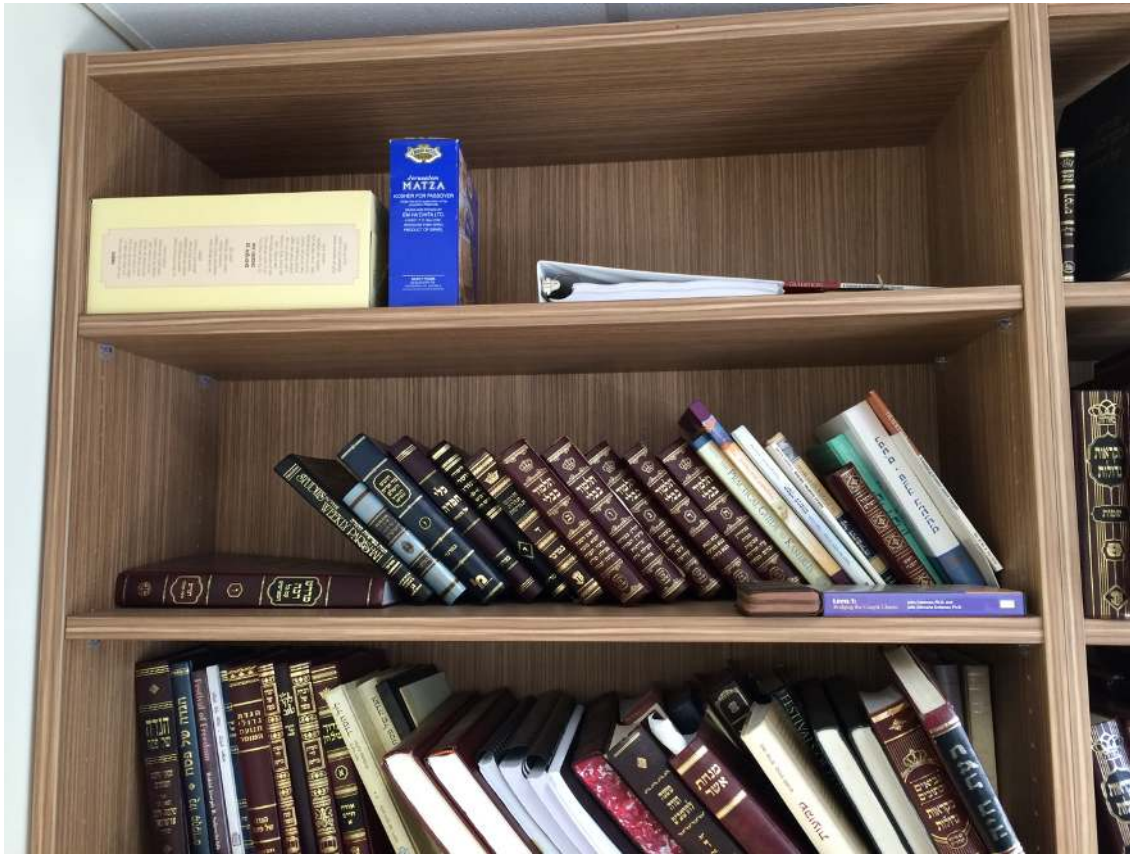
Figure 2 Matzah box in the upper shelf in the Rabbi's office in St Ives.