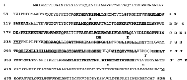
Figure 1. Predicted secondary structure of P450LDM from C. albicans B311. The predicted \alpha -helical regions of P450LDM as described by Boscott and Grant (1994) are shown in bold and underlined with the helix labels given at the end of each row. The seven amino acid variations found in the fluconazole-resistant C. albicans isolates are shown above the respective residue.

Prediction of secondary structures of P-450LDMs from C. albicans. The predicted secondary structure as assessed by the ability to form \alpha -helix conformations based on the model of Boscott and Grant [2] of P-450LDM from C. albicans B311 is shown in Figure 1. Four of the seven amino acid changes found in various FLZ-resistant clinical isolates, but not in the susceptible clinical and laboratory isolates, are located on the predicted \alpha -helical regions of P-450LDM. Although three of the four changes (K143R, E266D and D278E) located on the \alpha -helical regions are conserved substitutions, individually or collectively these alterations could contribute to the development of resistance to FLZ. At the present time, it is not clear if the observed in-vitro azole resistance of the clinical isolates is due to an alteration of the secondary structure of the protein initiated by one or more amino acid changes, or due to the alteration of amino acid residues that directly participate in the binding of the azole to the enzyme. The fact that a biologically functional P-450LDM was present in the FLZ-resistant isolates, suggest that the altered primary structure of the protein affected the susceptibility of the enzyme to FLZ without affecting its biological function.