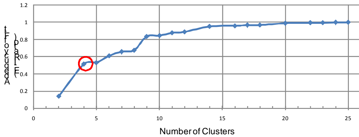
Figure 2: Determining the Optimal Number of Clusters

Note: The elbow point circled on the above plot suggests that four clusters offer the best fit. At fewer than four clusters, the agglomeration rapidly erases meaningful dissimilarities between groups of firms; at greater than four clusters, within-group similarity increases at a decreasing rate, adding little explanatory power.