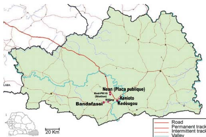
Figure 1. Map of the Kedougou area, Senegal, showing geographic position of villages and forest gallery where dengue virus serotype 2 vectors were collected.

After initial results of virus isolation from mosquitoes showed evidence of DENV-2 circulation, serologic investigations on monkeys were undertaken January 31–February 6, 2000. Blood samples were collected from each wild monkey captured with flexible nets in the forest gallery. Briefly, animals were immobilized with ketamine HCl (Merial, Lyon, France), 10–15 mg/kg of body weight, injected intramuscularly. Blood