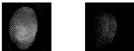
Fig. 2. Samples of fingerprint images from an easy class (left) and a difficult class (right).