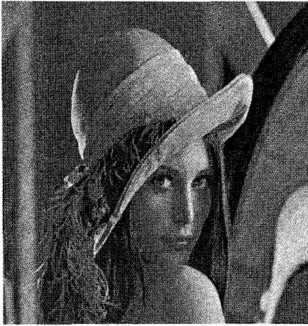
Fig. 2. ANMF of (1) using 3 \times 3 window.