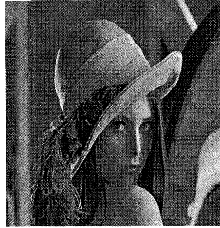
Fig. 4. DDF of (1) using 3 \times 3 window.