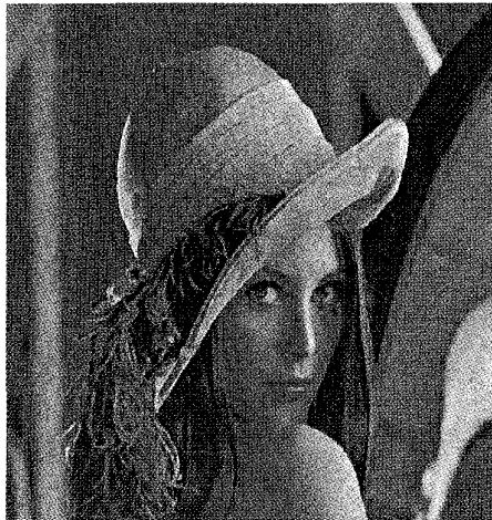
Fig. 3. ANNF of (1) using 3 \times 3 window.