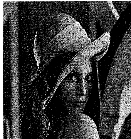
Fig. 1. "Lenna" corrupted with 4% impulsive noise.

It must be emphasized that the above multichannel vector processing filter is a general filter which can be applied to any type of vector processing problem. As an important example of vector processing, we select the problem of color image processing. In the different color spaces, each pixel of a color image is represented by three values which can be considered as a vector, transforming the color image to a vector field in which each vector's direction and length is related to the pixel's chromatic properties [1]. Thus, a vector processing filter is most appropriate to smooth out noise and preserve edges and details in color image processing. Two members of the proposed adaptive nearest-neighbor multichannel filter family, the ANNMF obtained with \alpha = 0 , n = s and the ANNMF2 obtained with \alpha = \frac{1}{d_{(n)} - d_{(s)}} , n = s are compared quantitatively with the widely used VMF, chromaticity-based filters such as the basic vector directional filter (BVDF), the generalized vector directional filter (GVDF) [3], and the directional-distance filter (DDF) [7] introduced lately to overcome the limitations of the VDF's, and finally the adaptive nearest-neighbor filter (ANNF) discussed in [4]. The color RGB test image "Lenna" has been contaminated using