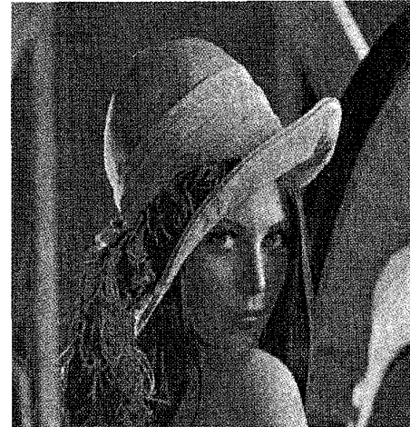
Fig. 5. GVDF of (1) using 3 \times 3 window.

which is estimated according to the following formula: