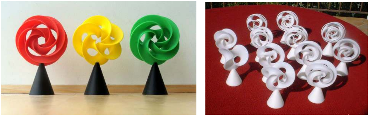
Fig. 2: Creations from Sculpture Generator I : (a) “Three Cinquefoils” (b) “Family of 12 Trefoils.”

In 1995 the College of Engineering at U.C. Berkeley acquired two rapid-prototyping machines, a Fused Deposition Modeling Machine from Stratasys and a 3D-printer from Z-Corporation. That is when I really started to experiment with my Sculpture Generator I , producing dozens of virtual designs, which I then was able to fabricate as small prototypes, 3 to 4 inches in diameter within a day or two (Fig.2a,b).