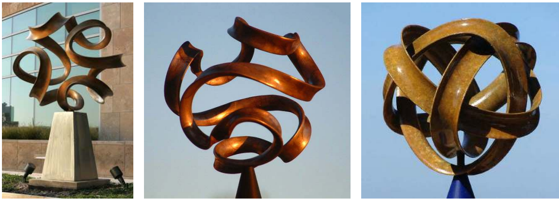
Fig. 4: A different paradigm: (a) “Pax Mundi II” (b) “Maloja” (c) “Hilbert Cube 512”.

SLIDE was first used to emulate “Pax Mundi,” another small wood sculpture by Brent Collins, which has a quite different underlying generating paradigm. In this case, the key concept is a ribbon undulating along the surface of a sphere in a symmetrical curve with 8 hairpin turns. I was fascinated by its exquisite elegance and also captured it in a computer program. This proved to be very useful several years later when Collins got a commission from H&R Block to scale up Pax Mundi into a 6-foot diameter bronze sculpture for the courtyard of their headquarters building in Kansas City. My SLIDE program was then readily able to adjust the dimensions to the required size and to slim the ribbon down to fit this large-scale metal sculpture and to keep it within its weight and budget limits. Figure 4a shows the finished sculpture “Pax Mundi 2,” which is again a collaborative effort between Brent Collins, Steve Reinmuth and Carlo Séquin.