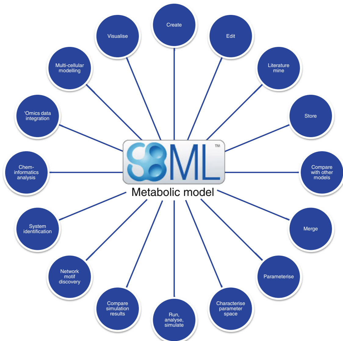
Fig. 1 A summary of some of the intellectual areas in which we can create and exploit the contents of systems biology models as encoded in SBML

detailed metabolic reconstruction of CHO. Additionally, one may anticipate the importance of predictions of metabolic fluxes in understanding nutrition and regulation in health and disease.