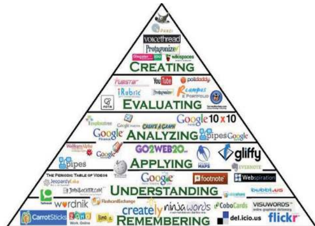
Figure 2. Web 2.0 Tools [22] based on Bloom's Digital Taxonomy [23]

5. Problem-solving: identify digital needs and resources, make informed decisions as to which are the most appropriate digital tools according to the purpose or need, solve conceptual problems through digital means, creatively use technologies, solve technical problems, update one's own and others' competences.