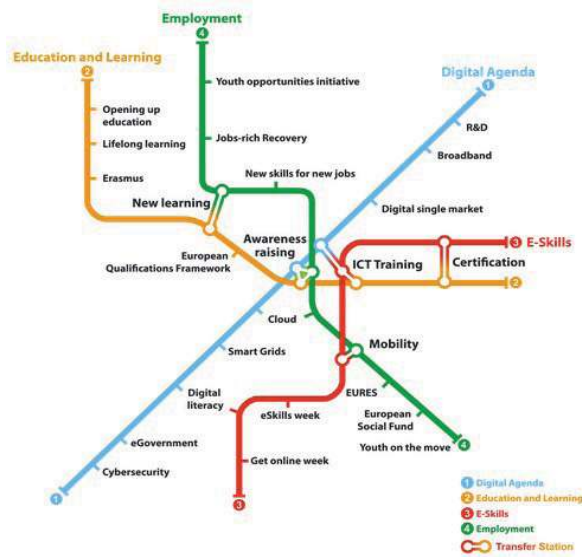
Figure 1. The Grand Coalition for Digital Jobs Network Map [9].

In 2013 the European Commission launched the Grand Coalition for Digital Jobs: a multi-stakeholder partnership that endeavors to facilitate collaboration among business and education providers, public and private actors to take action attracting young people into ICT education, and to retrain unemployed people. They have stated that 90% of jobs might require basic digital skills in careers such as engineering, accountancy, nursing, medicine, art, architecture, and many more [9].