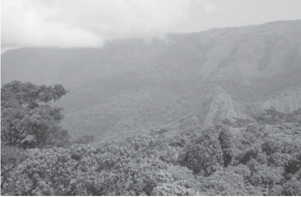
Plate 2 An area of extensive sub-montane and montane forest on Chappal Waddi (see Fig. 1 for location). The rock outcrop Dutsin Dodo is in the foreground.

two jackal Canis adustus , several colobus monkeys Colobus guereza and some baboons Papio anubis (Table 2).