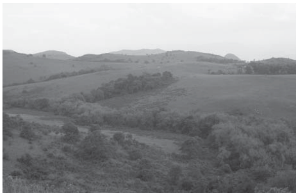
Plate 1 A riverside forest in the enclave Chappal Hendu (see Fig. 1 for location), which has become almost a monoculture of S. guineense var. guineense .

Chappal Hendu (Fig. 1) is 28.5 km 2 of undulating grassland plateau, c. 1,680 m in elevation with forest fragments confined to stream sides (Plate 1). The c. 7.5 km 2 of forest known as Dutsin Lamba (2,100 m) is the highest point on Chappal Hendu; the forest is confined to the steep west-facing slopes. Fulani first grazed their cattle on Chappal Hendu in the 1950s (Morris, 1950). When the plateau became an enclave of the Gashaka Gumti Game Sanctuary in 1972, its human population was several hundred, confined to Selbe village except for transient Fulani camps. Cattle numbers were sufficiently low to pose little threat to the montane grassland. Two types of riparian forest were then common on Chappal Hendu: Syzigium guineense var. guineense – Albizia gummifera , and