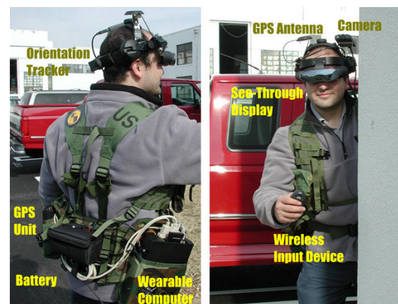
Figure 2: An annotated view of the hardware configuration of the current BARS prototype.

A channel contains a class of objects and distributes information about those objects to members of the channel. Some channels are based on physical areas, and as the user moves through the environment or modifies the spatial filter, the system automatically joins or leaves those channels. Other channels are based on semantic information, such as route information only applicable to one set of users, or phase lines only applicable to another set of users. In this case, the user voluntarily joins the channel containing