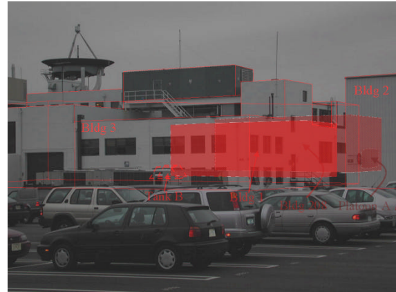
Figure 3: A sample protocol to show the location of occluded objects. The first three layers are shown with outlines of varying styles. The last three layers are shown with filled shapes of varying styles.

User interaction occurs in user-based and task-based contexts that are defined by the application domain. Domain analysis plays a critical role in laying the groundwork for developing a user-centered system. We performed domain analysis in close collaboration with several subject matter experts (i.e. military personnel who would be candidate BARS users) [Gabbard-02]. Domain analysis helps define specific user interface requirements as well as user performance requirements, or quantifiable usability metrics , that ensure that subsequent design and development efforts respect the interests of users. User information requirements , also identified during domain analysis (and focused through the development of use cases and scenarios), ensure that the resulting system provides useful and often time-critical insight to a user's current task. The most intuitive and usable interface in the world will not make a system useful, unless the core content of the system provides value to the end user. Finally, domain analysis may also shape system requirements, typically with respect to system components that affect user performance.