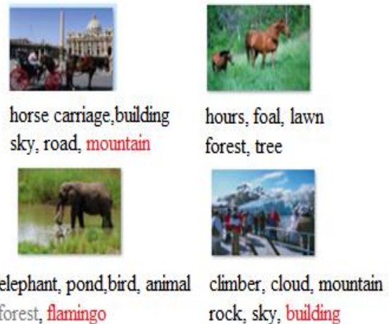
Fig. 3. Qualitative image annotation results obtained with our model.

Obviously, the evaluated results confirm that the proposed model provides almost the same performance results like the G-LSTM and Soft/Hard Attention. In addition, we can observe that the significant performance improvement compared to the Multi-AE or the L-RBSAE. The precision and the recall metrics of proposed model are also comparable with those of the recently proposed models, for the Corel-5 K and IAPRTC-12 datasets. Fig. 3 shows some sample images and annotations examples from the Corel dataset after implementing the proposed model. Even though, some of the predicted tags for these annotations do not match with the image, still they are very meaningful.