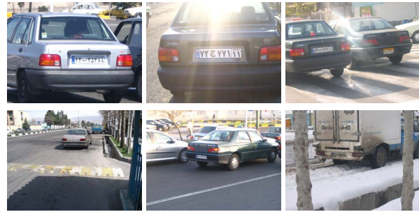
Figure 4. Some sample images.