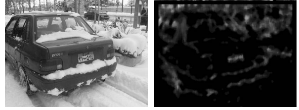
Figure 1. Finding vertical edges: (a) input gray-scale image, (b) vertical edges.