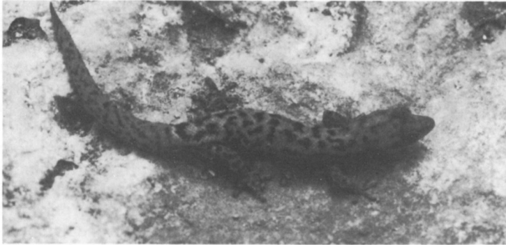
Monito gecko (C. Kenneth Dodd (Jr)).

will be in sight at any given moment. . . . The apparent low numbers of Ameiva and Sphaerodactylus might be the result of rat predation. If the Sphaerodactylus turns out to be an endemic species or subspecies and if its numbers are as low as our data indicate, a rat removal program may be necessary for its preservation.'