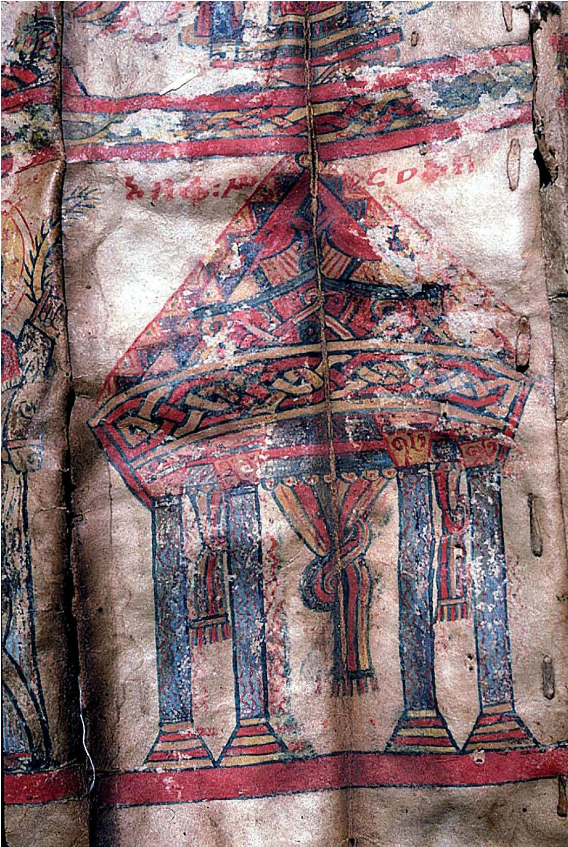
Fig. 13: Flabellum, Entry into Jerusalem (detail), Enda Abbate Wäldä Yoḥannēs.