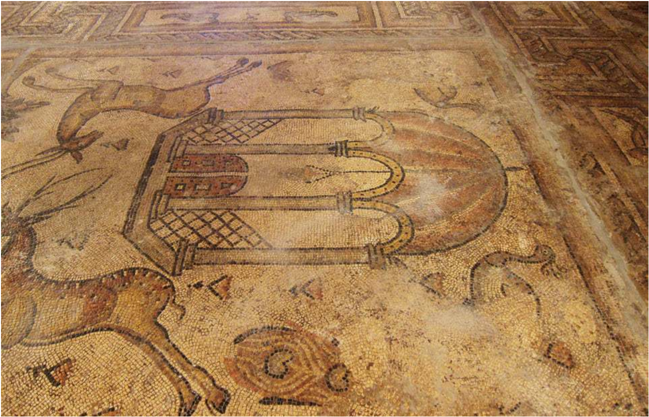
Fig. 12: Tempietto , Syria, Church of Temanaa.

Temanaa in Syria (Fig. 12), 130 attest to the wide circulation of such motifs in Late Antiquity. Likewise, the two deer in the Soissons Gospels and the antelopes in the Temanaa mosaic must also depend on models similar to those which influenced the Ethiopian tradition. This is true for all the animals which surround the Tempietto in Ethiopic gospels, since they recall motifs frequently employed in different media across the larger Mediterranean realm of Late Antiquity. 131