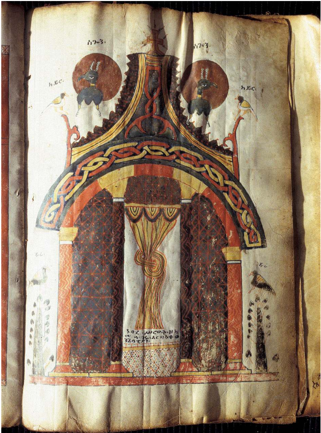
Fig. 10: Gospel book, Tempietto , Amba Dära, Maryam Mägdälawit, fol. 18r, 36.4 × 27 cm.