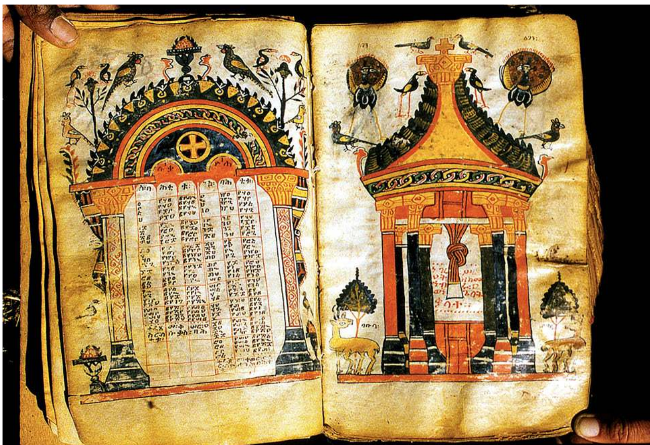
Fig. 2: Gospel book, Tempietto , Gär'alta, Däbrä Mä'ar, fol. 10r, 28.2 × 18.5 cm.

tic relationship to other roughly coeval witnesses of the subject in illustrated Ethiopic gospel books dating from the late thirteenth to the early fifteenth centuries.