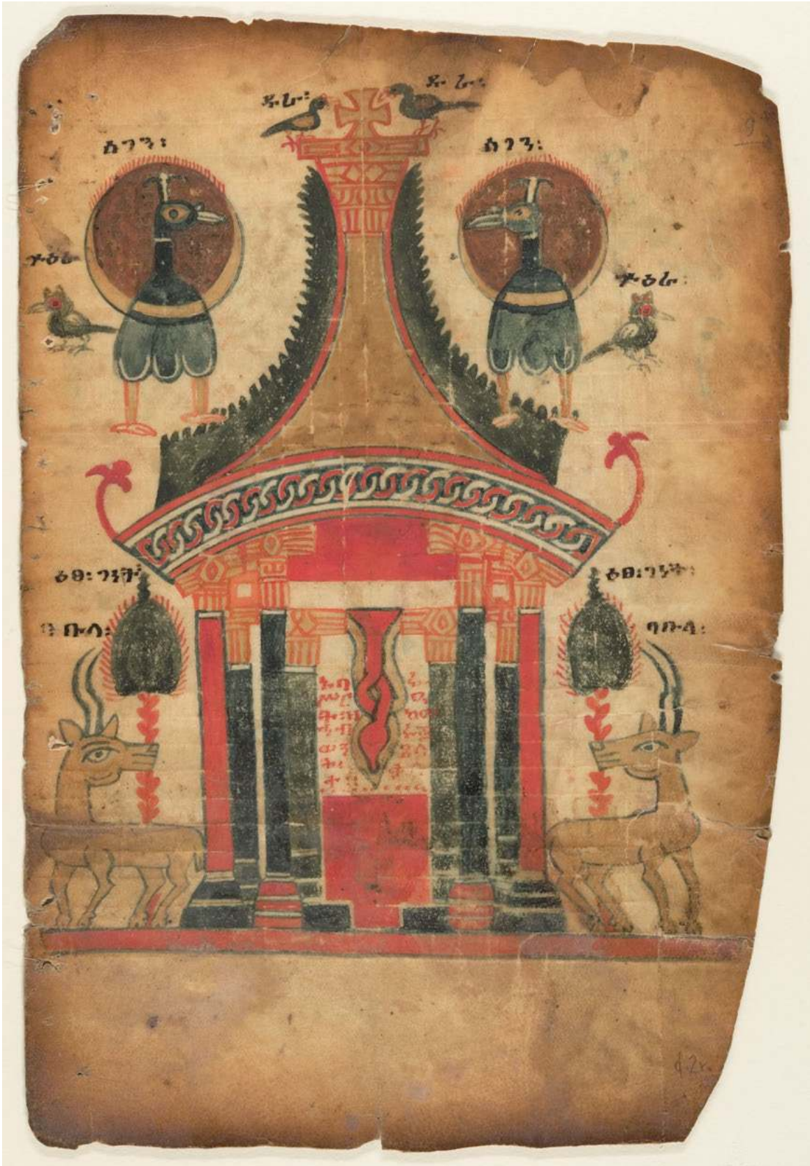
Fig. 1: Leaf from an Ethiopian gospel book, Tempietto , New York, The Metropolitan Museum of Art, acc. no. 2006.100, 27.8 × 19 cm.