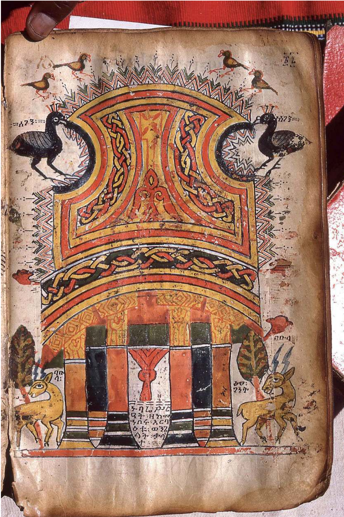
Fig. 7: Gospel book, Tempietto , Addis Ababa, National Library, MS 28, fol. 14r, 29 × 19.5 cm.