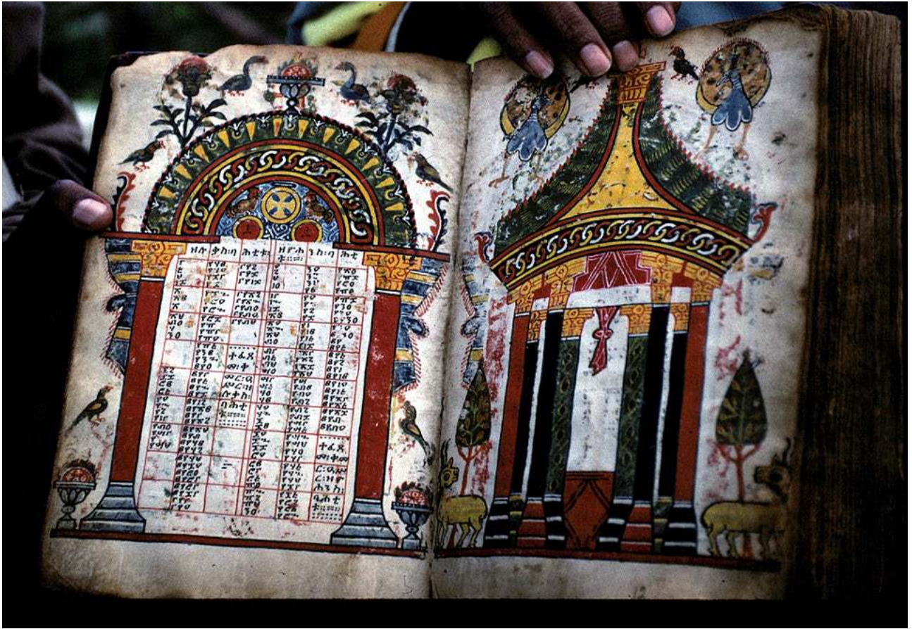
Fig. 6: Four Gospels, Tempietto , Ḥayq, Däbrä Ḥayq Ḥeṣṭifanos, fol. 12r, 27.5 × 17.5 cm.

As for the Rabbula Gospels, rather than the frontispiece with Eusebius and Ammonius analyzed by Underwood, it is the shrubs that grow above the roofs of the structures framing the miniatures of the Selection of Matthew and the Enthroned Christ with Four Monks that recall the Ethiopian examples of this motif. 57 It is also possible to find a few distant parallels in the Greek tradition, as shown by a Tempietto miniature in a manuscript kept in the Stauronikita Monastery on Mount Athos 58 or by the architectural frame above a standing Christ in one of the ninth-century leaves inserted in Garrett 6. 59