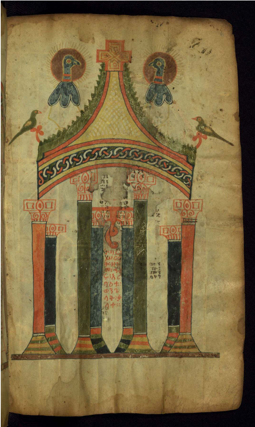
Fig. 8: Gospel book, Tempietto , Baltimore, The Walters Art Museum, W.836, fol. 6r, 26.6 × 16.5 cm.