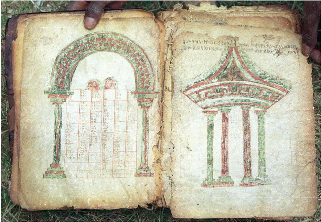
Fig. 5: Gospel book, Tempietto , Akkälä Guzay, Däbrä Libanos, fol. 7r.

The patterns that crest the roof of the Met's leaf, IES-3475, KTN and WAM-836 (Figs 1, 7–8) represent an intermediary stage in this shift towards greater abstraction. In KGL and MET-1998.66, where lozenge patterns replace the pointed elements, the stylization process has reached its culmination. Here all memory of the original feature seems lost and we can only reconstruct a convincing sequence of transmission by comparison with the earlier examples.