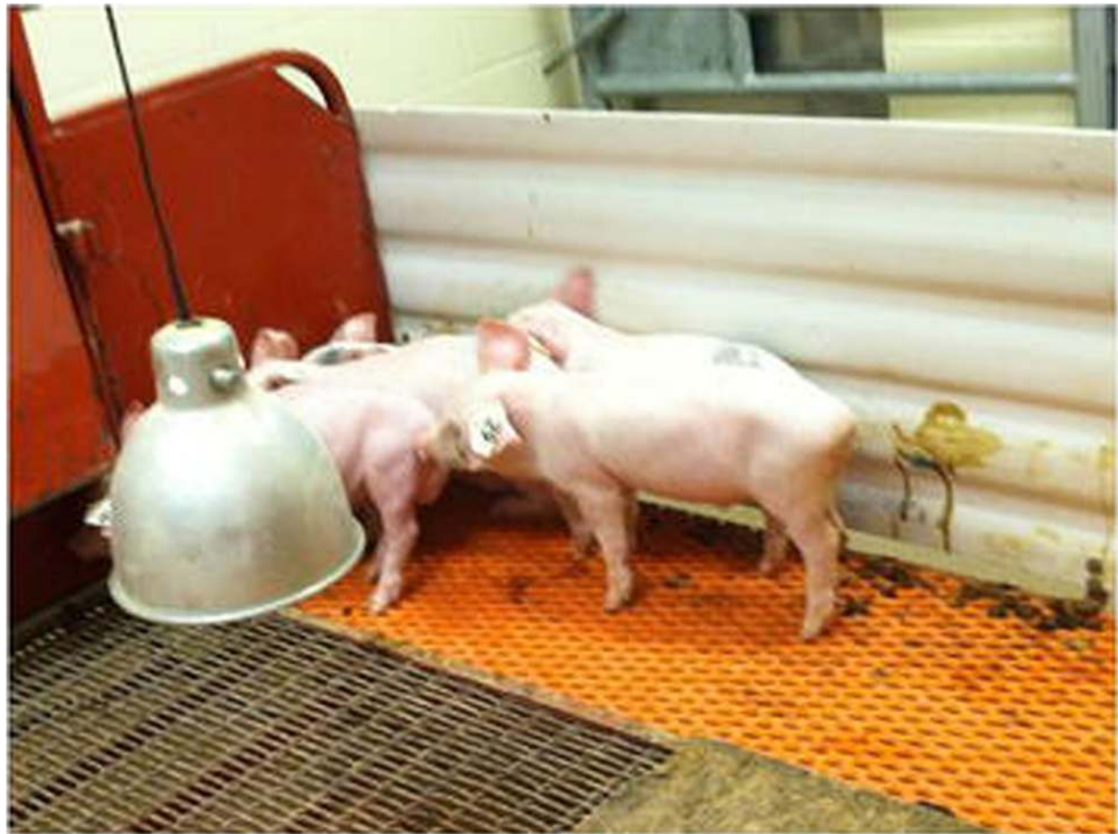
Figure 1 PED in treatment group. Depicted in this figure are clinically affected piglets from the Treatment group on day 6 post-ingestion of PEDV-contaminated feed. Piglets demonstrated loss of condition, rough hair coats, along with clinical signs of PED (diarrhea and vomiting). Evidence of diarrhea is visible on the pen wall behind the pigs. Prior to necropsy, rectal swabs from all 5 piglets were PEDV-positive as detected by PCR.

* = 2 pigs detected as positive on rectal swabs.