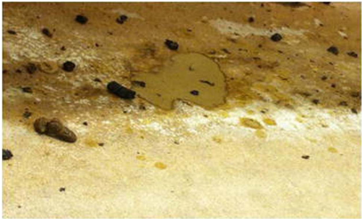
Figure 3 Diarrhea on floor below the positive control group pen. Following ingestion of feed spiked with stock PEDV, piglets in the Positive control group developed clinical signs of PED 2 days post-ingestion. This photo illustrates watery diarrhea observed below the pen floor housing these piglets.

The in vivo phase of the study was conducted from January 17–24 and results are summarized in Table 2. Prior to initiation of the in vivo phase of the study, all