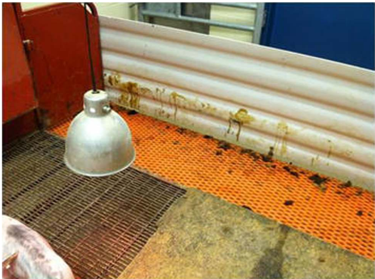
Figure 2 Diarrhea in the treatment group pen. This figure illustrates fecal staining on the wall of the pen housing the Treatment group piglets. This image was taken on day 6 post-ingestion of PEDV-positive feed.

For select samples, it was planned to conduct nucleic acid sequencing of the PEDV S1 gene. Specifically, fragments of the S1 domain of the spike gene were amplified from extracted RNA. Primers 1: (5'- ATGARGTCTTT AAYTACTTCTGG-3'), 2: (5'-CATCCTCACCWGCA CTAGTAAC-3'), 3: (5'- GTTGTGCTATGCAATATGT TTAY-3'), 4: (5'-TGAAATTAATTGTGACAGCATC-3'), 5: (5' -TTGTCATCACCAAGTAYGGTG -3'), 6: (5'- CT AAAAGACAGGTAATCATTAACAG- 3'), 7: (5'- CTG TGTTGACACTAGACAATTTAC- 3'), 8: (5'- CATACT AAAGTTGGTGGGAATAC- 3') were designed to anneal to conserved genomic regions. Incorporation of degenerate bases maximizes the ability of the PCR to amplify genetically divergent PEDV variants between the US and UK strains. Primer pair 1 and 2 obtained a PCR product size of 670 bp, primer pair 3 and 4 obtained a PCR product size of 678 bp, primer pair 5 and 6 obtained a PCR