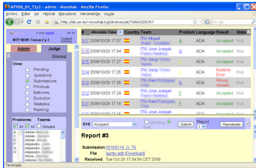
Fig. 1. Sample view for a judge (teacher) of Mooshak.

Mooshak has a web-based interface, which is different for the students, teachers, guest users and the system administrator (see Figure 1). For example, a user (student) can access the description of the problems, the list of submissions sent by all users, the ranking of the best students, and the questions asked and answered. In contrast, a judge (teacher) can see and analyze the submissions sent, rejudge submissions, answer questions, and view statistics of system's usage.