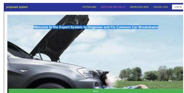
Fig (3) shows the user interface