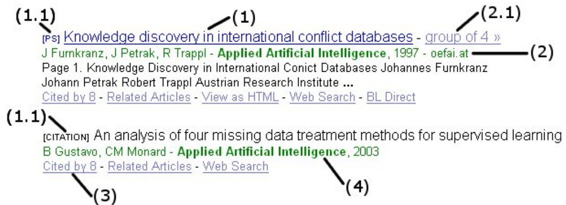
Figure 3: Two typical records of a Google Scholar result. Search was for the journal Applied Artificial Intelligence .