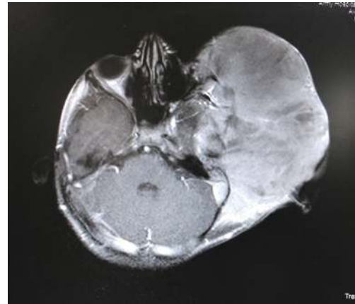
Figure 3 MRI brain and face showing intracranial extension of the mass into left temporal lobe.

nerve. Post-operative histopathological report (HPR) revealed poorly differentiated Rb. There was no history of Rb in his family. After 4 days the child developed swelling left parotid area, fine needle aspiration cytology (FNAC) of which showed small round blue cell tumor