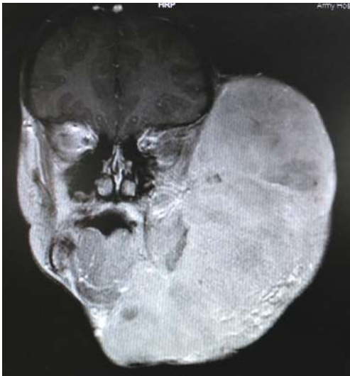
Figure 2 MRI brain and face showing large lobulated mass lesion left side of face, neck, upper anterior chest, superiorly extending to left fronto-temporal scalp and inferiorly upto left anterior chest wall, causing erosion of ramus of mandible, muscles of mastication and oral cavity.

nerve. Post-operative histopathological report (HPR) revealed poorly differentiated Rb. There was no history of Rb in his family. After 4 days the child developed swelling left parotid area, fine needle aspiration cytology (FNAC) of which showed small round blue cell tumor