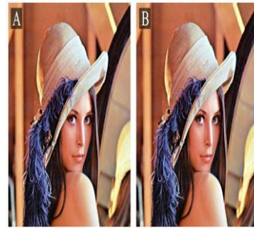
Fig. 3. A. Original image; B. Stego image

PRNG. Then, message bits were embedded at the random-edge area pixel locations and smooth area pixel locations using modified LSB insertion algorithm. Fig. 3 presents the results of applying this technique to standard image Lena and cumulative results analysis is presented in Table I.