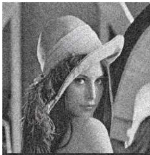
Figure 2. the original Lena image

Use the Lena image with Gaussian white noise as the original image. First, use the traditional edge detection operators to do edge detection, and the results are showed in Figure 2,3,4,5,6: