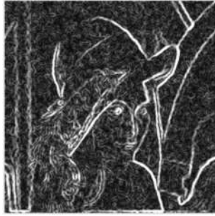
Figure 8. mean filter and Sobel operator

Figure 7 shows the method which combines the median filter and Sobel operator. Median filter can remove spike and high-frequency noise signals, it can also suppress step and slope mutation, at the same time it doesn't cause mutations in phase. Therefore, it plays a certain role in filtering white noise signals. We can see that compared the result with that obtained by other classical operators, the noise signals of the image are removed cleaner. However, it is just due to setting high-frequency coefficients to 0 leads to the reduction and removing of peak hopping when doing first-order derivative to the image edge. And this makes the images obtained by edge detection very blurring and it will also neglect some edge details.