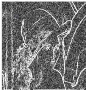
Figure 3. Sobel edge detection operator