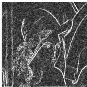
Figure 4. Prewitt edge detection operator