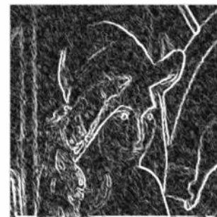
Figure 7. median filter and Sobel operator

In order to overcome this defect, the paper combines some commonly used de-noising methods and these classical operators, such as median filter and mean filter de-noising, see in Figure 7 and 8: