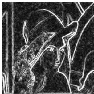
Figure 9. soft-threshold wavelet de-noising and Sobel operator

The paper proposes an edge detection method which combines soft-threshold wavelet de-noising and Sobel operator. See in Figure 9: