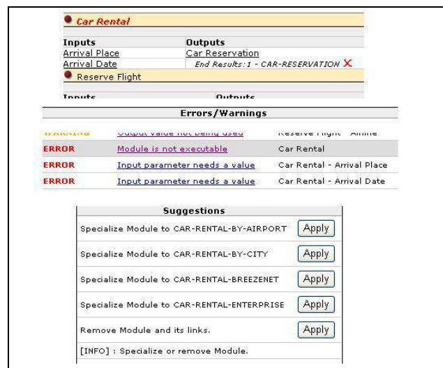
Figure 5. Component added by applying system’s suggestion; system points out that some components are not executable.

the added components are both not executable (i.e., they represent generic families of services). Suggestions for specializing “Car Rental” are also shown in Fig. 5, based on the component ontology (i.e., how they are related to each other).