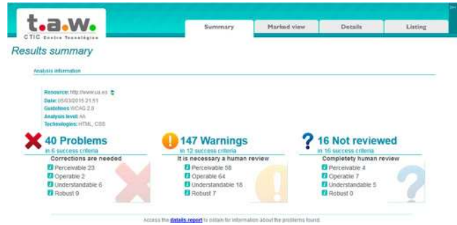
Fig. 2. Results obtained from the Web accessibility tool.

Among these tools, jQuery, a general-purpose JavaScript library, was used in the analysis to locate and account for specific HTML features required by the activity. It was used to write a script that automated the analysis and validation of all the specified features.