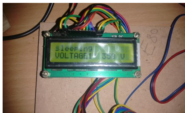
Fig (c): normal eyeblink message on LCD