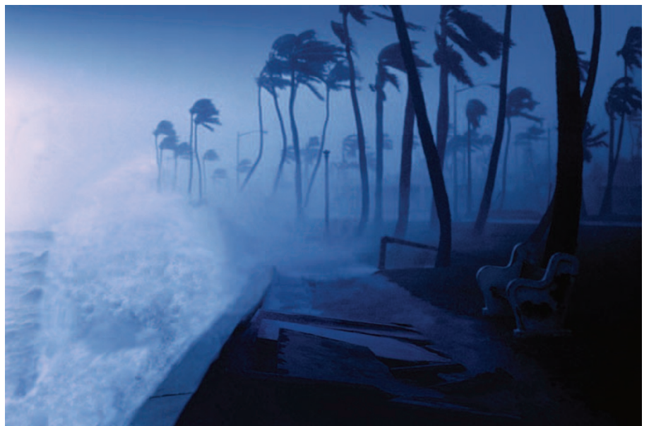
Should we be spending more on protecting ourselves against the adverse effects of global warming?

The book is a series of exercises in cost–benefit analysis, interspersed with quotes on climate change from the writings of famous people who should know better than to speak in hyperboles. Lomborg produces figures to show that it would be better to replace the Kyoto Protocol with strategies that encourage economic growth and blunt the harmful effects of