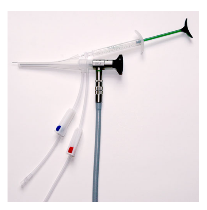
Fig. 1 The Urethroscope, connected to the rotatable sheath, with inflow/outflow tubings. The needle (23G x 12 cm) is placed in the working-canal connected to a 1 ml syringe with Bulkamid

Two or three deposits (0.2–0.8 ml each) were placed 0.5–1 cm distal to the bladder neck at 2, 6, and 10 o'clock positions. The needle was re-sited if the injection appeared