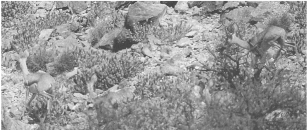
Dorcatragus megalotis , Djibouti 1994.

between the Government of Djibouti and the opposition, the situation is returning to normal and wildlife surveys should become possible in the future.