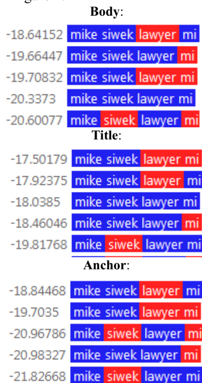
Figure 1: Top 5 segmentation hypotheses under body, title, and anchor language models.

In this demonstration, we implement a straightforward algorithm that generates hypotheses of the segment boundaries at all possible placements in a query and rank their likelihoods using the N-gram service. In other words, a query of T terms will have 2^{T-1} segmentation hypotheses. Using the famous query “mike siwek lawyer mi” described in (Levy, 2010) as an example, the likelihoods and the segmented queries for the top 5 hypotheses are shown in Figure 1.