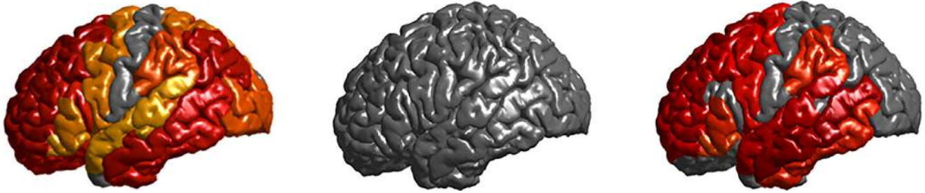
FIGURE 3 Summary of the cortical thickness effects in adult OCD patients compared to healthy controls in ENIGMA-OCD, in relation to medication status (based on Boedhoe et al., 2018 Am J Psychiatry). Negative effect sizes d (ranging from light orange d = -0.05 to dark red d = -0.15 ) indicate thinner cortex in OCD compared to controls

medicated OCD (n=646) vs unmed. OCD (n=831)