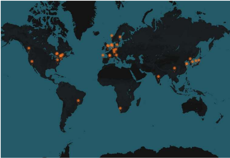
FIGURE 1 World map showing the 34 institutes participating in the ENIGMA-OCD consortium

cross-sectional structural MRI data a mega-analysis performs better than a meta-analysis (lower standard errors and narrower confidence intervals), and in a multi-center study with moderate variation between cohorts, a linear mixed-effects random-intercept mega-analytical framework seems to lead to the best model fit (Boedhoe et al., 2019).