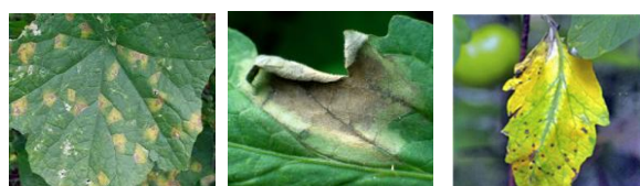
(a) late blight (b) early blight (c) downy mildew Figure 2. Fungal disease on leaves

Among all plant leaf diseases, those caused by fungus some of them are discussed below and shown in figure 2, e.g. Late blight caused by the fungus Phytophthora infestans shown in figure 2(a). It first appears on lower, older leaves like water-soaked, gray-green spots. When fungal disease matures, these spots darken and then white fungal growth forms on the undersides. Early blight is caused by the fungus Alternaria solani shown in figure 2(b). It first appears on the lower, older leaves like small brown spots with concentric rings that form a bull's eye pattern. When disease matures, it spreads outward on the leaf surface causing it to turn yellow. In downy mildew yellow to white patches on the upper surfaces of older leaves occurs. These areas are covered with white to greyish on the undersides as shown in figure 2(c).