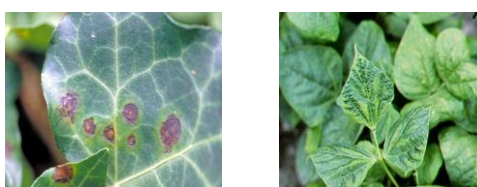
(a) Bacterial leaf spot (b) mosaic virus Figure 1. Bacterial and Viral disease on leaves

Among all plant leaf diseases, those caused by viruses are the most difficult to diagnose. Viruses produce no telltale signs that can be readily observed and often easily confused with nutrient deficiencies and herbicide injury. Aphids, leafhoppers, whiteflies and cucumber beetles insects are common carriers of this disease, e.g. Mosaic Virus, Look for yellow or green stripes or spots on foliage, as shown in figure 1(b). Leaves might be wrinkled, curled and growth may be stunted.