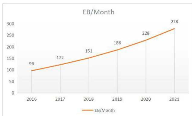
FIGURE 3. Annual monthly average statistics/forecast of global internet traffic.

With the rapid development of the emerging Internet industry, the booming application programs have led to the continuous growth of Internet traffic. According to the forecast [53], the total global IP traffic will triple between 2016 and 2021, from an annual average of 1.2ZB(96EB/ month) in 2016 to 3.3ZB(278EB/ month) in 2021. Figure 3 shows the statistics and forecast of the annual monthly average of global internet traffic. The proportion of video in Internet traffic will increase from 73 percent in 2016 to 82 percent, and it can be predicted that this proportion will increase year by year.