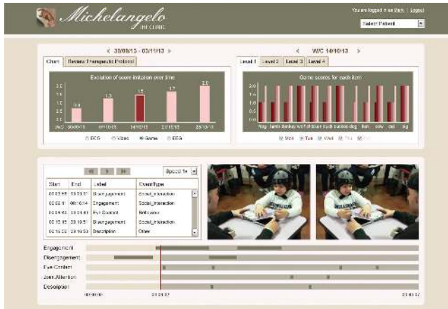
Fig. 3. Michelangelo project aggregated data visualisation on clinical user interface

The clinical tools also permitted further EEG analysis, which comprised off-line, artefact removal (using video playback to identify an appropriate resting state period), followed by event identification, such as eye contact during the task, during which the related EEG signal was processed via clustering techniques in order to identify areas of interest. The clinician is subsequently able to view the results from the analysis, select the appropriate number of synchronostates and visualize the corresponding brain activity for the event [31]. Consequently, such tools, which incorporate EEG as another physiological component, can potentially provide additional insights into both the treatment and understanding of the underlying conditions.