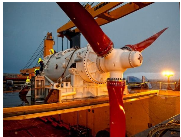
Fig. 2. Andritz Hydro Hammerfest HS1000 turbine.