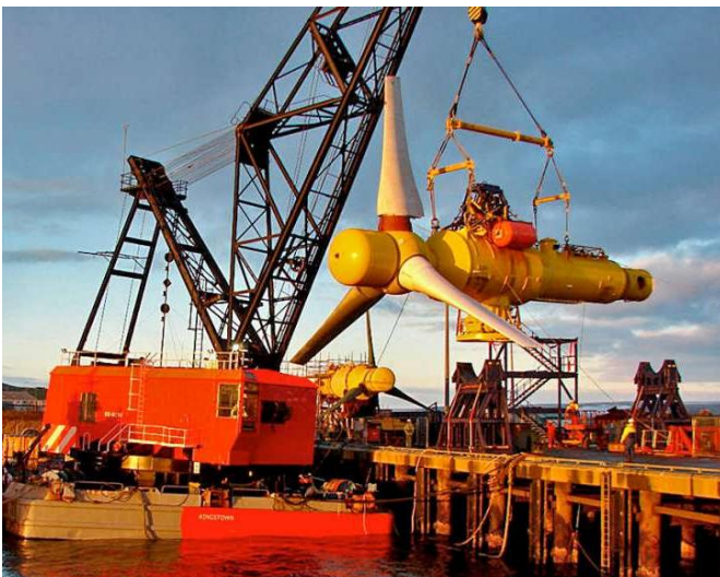
Fig. 7. Alstom tidal turbine © [23].

In 2013, Alstom successfully installed a 1 MW tidal current turbine at EMEC tidal test site after the acquisition of Tidal Generation Limited (TGL) [23-24]. Figure 7 shows the Alstom's 1 MW tidal turbine system. This tidal turbine weighs 150 tonnes and has three pitchable blades, a rotor diameter of 18 m and a nacelle length of 22 m. A standard drive train and power electronics device is inside the nacelle. This turbine system can be installed in a water depth between 35 and 80 meters. It can generate electricity with a tidal current between 1 m/s and 3.4 m/s, and reaches the rated power for a tidal current speed of 2.7 m/s. This 1 MW Alstom tidal turbine is under extensive testing and analysis in different operational conditions off Orkney islands throughout 2013 over an 18 month period.