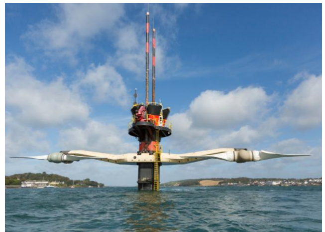
Fig. 4. SeaGen S turbine.