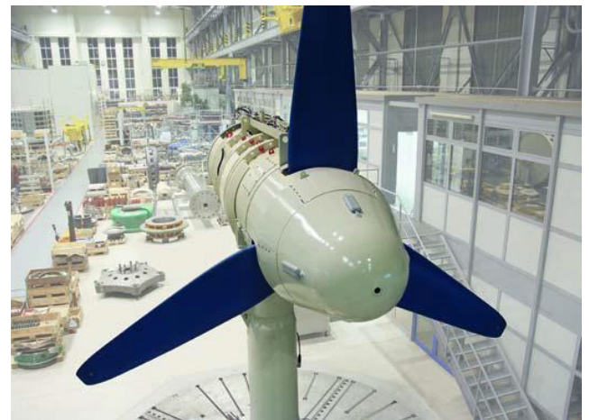
Fig. 5. Voith Hydro turbine © [18].