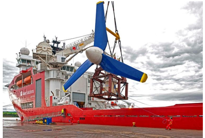
Fig. 3. Atlantis AR1000 turbine © [14].

rotor diameter) which was tested at Bénodet estuary near Brest in 2008. The prototype D10 turbine is now completing the construction and is scheduled to be installed in the Fromveur passage at the end of 2014. Larger turbines D12 and D15 with power capacities of 1~2 MW are under design for future turbine farm applications [19-20].