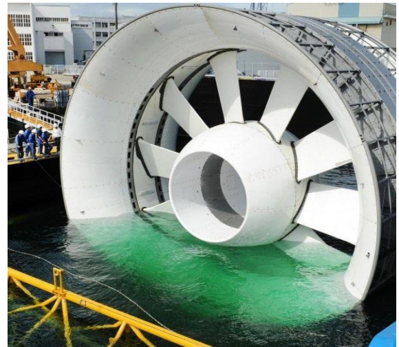
Fig. 1. DCNS-OpenHydro turbine © [11].

Another candidate for the MeyGen project is the AR1000 turbine (Fig. 3) technology developed by Atlantis Resources Corporation [14]. The Atlantis AR1000 turbine features fixed pitch configuration and is rated at 1 MW at 2.65 m/s current velocity. The AR1000 can be rotated in the slack period between tides using a yaw drive for optimally facing the tides. The first AR1000 was successfully deployed and tested at the EMEC facility during the summer of 2011. The AR1000 system is also scheduled to be installed on Daishan demonstration site in China during 2014. A larger turbine called AR1500 (1.5 MW at 3.0 m/s) is under development for