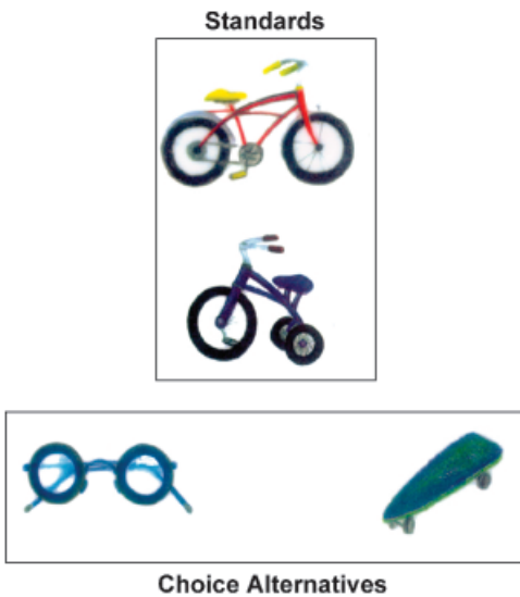
Fig. 2. Sample item from the Gentner and Namy (1999) study. Children who learned a novel word (e.g., “blicket”) for either of the two standards (bicycle or tricycle) extended the word to the perceptual match, the eye-glasses. Those who heard a common label for the two standards extended the word to the category match, the skateboard.

supporting. Perceptual commonalities are often correlated with deep relational commonalities: For example, fins and gills are associated with a different kind of breathing process than legs and fur are. A striking aspect of the current findings is that comparing two things that were highly perceptually similar led