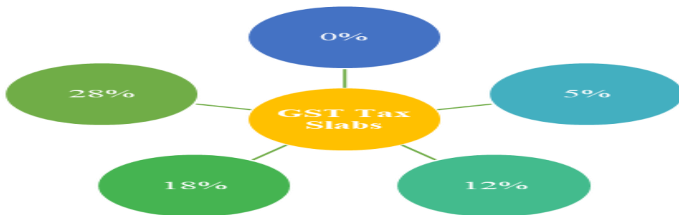
Figure 1. GST rates in India

Essential services and food items have been placed in the lower tax brackets, while luxury services and products have been placed in the higher tax bracket. Government exempted the regular consumption foods like fresh fruits and vegetables, milk, buttermilk, curd, natural honey, flour, bread, etc., from GST for the benefit of masses. Over 1300 goods and 500 services have been classified under four tax slabs of 5%, 12%, 18% and 28% (Figure 1). GST on gold has been kept at 3% and rough precious, diamonds and semi-precious stones is placed at a special rate of 0.25% (Kotak, 2019).