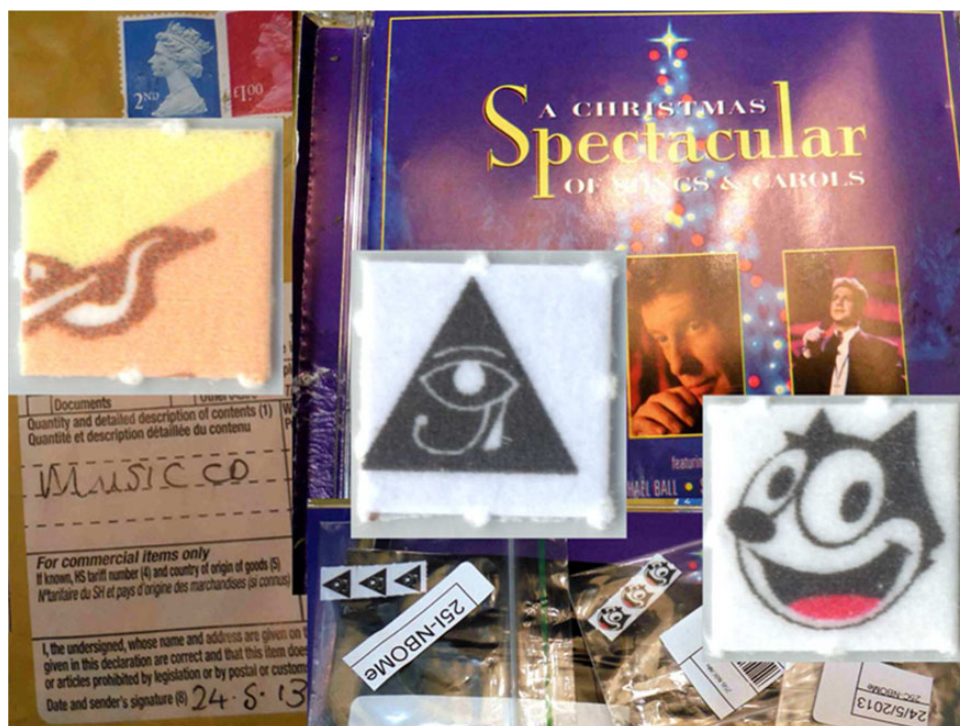
Figure 1. NBOMe blotter papers as delivered.

The screening was performed using a DART-MS operated in positive-ion mode and controlled by Mass Center software version 1.3.4m (JEOL Inc. Tokyo, Japan). The Direct Analysis in Real Time ion source had the helium gas flow rate at 2.0 L/min, gas heater temperature of 300°C, discharge electrode needle at 4,000 V, Electrode 1 was set at 150 V and Electrode 2 at 250 V. The resolving power of the mass spectrometer was 6,000 full width at half maximum. Measurements were taken