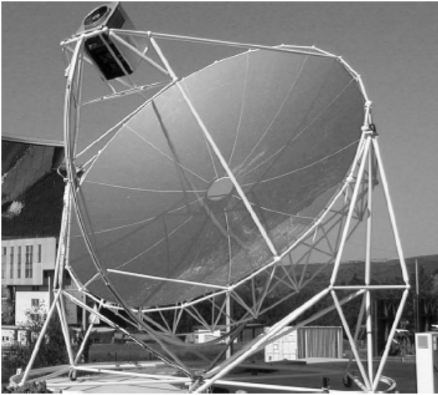
Fig. 1 Dish–Stirling system

concentrator shell, receiver, Stirling engine, tracking system, cooling system, and structural framework.