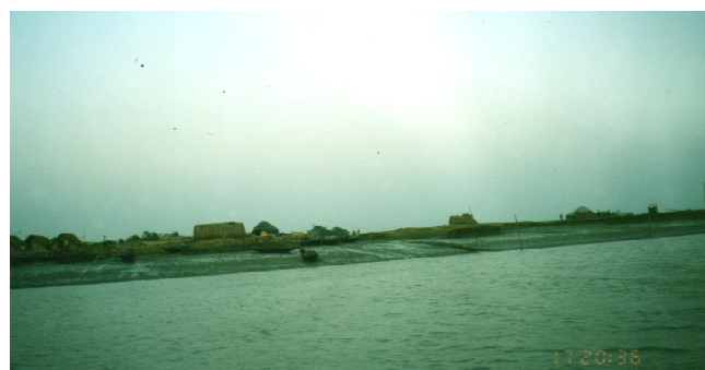
Figure 2.0. Photograph of part of the Sundarbans coastal area, near compartment number 26, where the trees have been cut down to be replaced by a fishing village.

The Sundarbans, like other tidal forests, is tolerant of natural disturbances such as the cyclones and tidal waves of the Bay of Bangle, but it is highly vulnerable to human disturbances (Seidensticker, 1983). Most of the abuses found in professional forestry management elsewhere have been observed here as well, such as excessive cutting of stocks in the auctioned area and connivance between purchasers and forestry staff to cut wider areas than sanctioned (Bari, 1993).