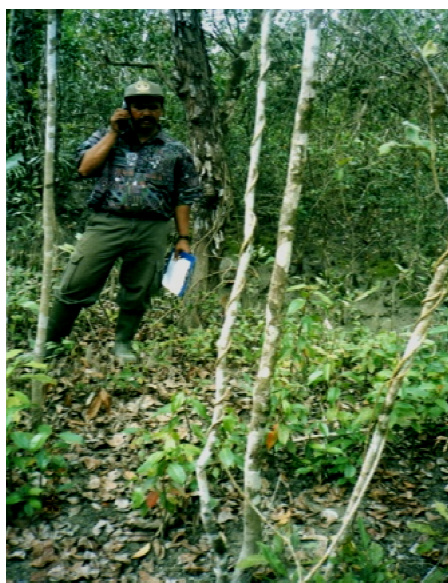
Figure 4.0. Photograph showing the Sundarbans forest trees and understory vegetation. The adult trees behind the author are Heritiera fomes . The forest floor shows dead leaves from trees affected by top-dying.

Intensive field data collection was made among these nine selected plots (in Figure 3.0). Observations were performed from observation towers during low and high tides, also traversing the forest floor and vegetation on foot, as well as using a speed boat, trawlers, country-boats, and a launch as required to gain access.