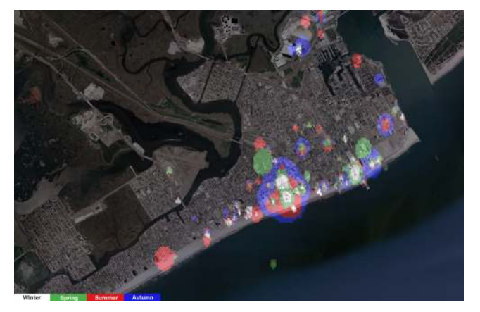
Figure 1. Growth Ring Maps showing the seasonal differences of taking photos for Atlantic City.

of taking the photos: the earlier the photo was made, the closer the pixel is to the central point. Color-hue is used to map semantic properties of the events or places. Thus, seasonal differences in visiting the places may be investigated by mapping the seasons to four distinct colors (winter-white, spring-green, summer-red, and autumn-blue). The resulting map shows simultaneously the intensity of taking photos at different locations and the seasonal differences. Figure 1 exposes salient distinctions among the seasonal patterns of taking photos in different places of Atlantic City. In the most popular places, the photos were taken all the year around but more photos were made in summer and autumn. In the other places, we see a clear prevalence of a single season.