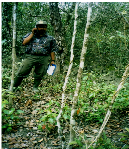
Figure 4.0. Photograph showing the Sundarbans forest trees and understory vegetation. The adult trees behind the author are of Heritiera fomes . The forest floor shows dead leaves from trees affected by top-dying.

Intensive field data collection was made among these nine selected plots (in Figure 4.0). Observations were performed from observation towers during low and high tides, also traversing the forest floor and vegetation on foot, as well as using a speed boat, trawlers, country-boats, and a launch as required to gain access.