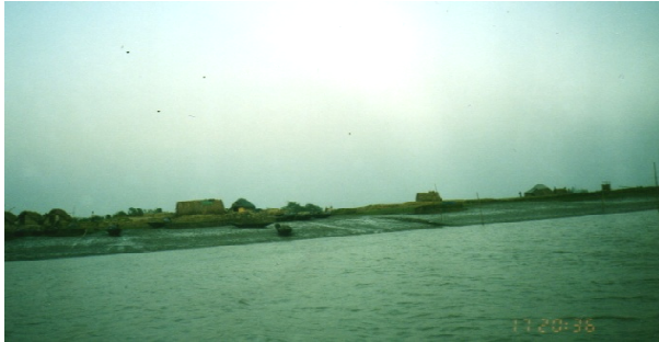
Figure 2.0. Photograph of part of the Sundarbans coastal area, near compartment number 26, where the trees have been cut down to be replaced by a fishing village.

found in professional forestry management elsewhere have been observed here as well, such as excessive cutting of stocks in the auctioned area and connivance between purchasers and forestry staff to cut wider areas than sanctioned (Bari, 1993).