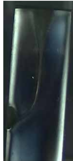
Figure 2 - Absence of stress.

The analysis of the fringes followed the ASTM colour scale (2001) [8] (Table 1). The absence of stress is shown in Figure 2.