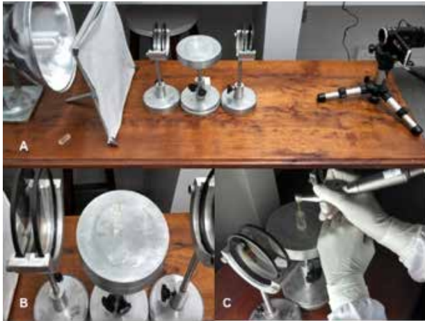
Figure 1 - Photoelastic model: A – Positioning on a rotating platform. A video camera was positioned in front of the polariscope lens. B - The model was observed by using polariscope before application of force in order to verify absence of residual stress in the material. C - The R25 file was mounted to the motor handpiece and inserted into the simulated canal as much as possible without forcing the instrument.

Next, the R25 file was mounted to a motor handpiece (Silver Reciproc, VDW, Munich, Germany) and inserted into the simulated canal as much as possible without forcing the instrument, according to the manufacturer's recommendations. The file was moved in and out until being removed from the canal after the fifth penetration. A video camera was positioned in front of the polariscope lens and the entire sequence of preparation with R25 file during the first and second instrumentations was recorded (Figure 1). Next, the video was analysed and the image of the fourth penetration was copied. To evaluate the fringes formed, the blocks were divided into cervical, medium and apical thirds of 4 mm each, completing 12 mm of working length. The order of the fringes formed was evaluated in the cervical, middle and apical thirds at mesial and distal areas, considering the colour sequence produced in the photoelastic material (Table 1) as follows: cervical-mesial (CM), cervical-distal (CD), middle-mesial (MM), middle-distal (MD), apical-mesial (AM) and apical-distal (AD).