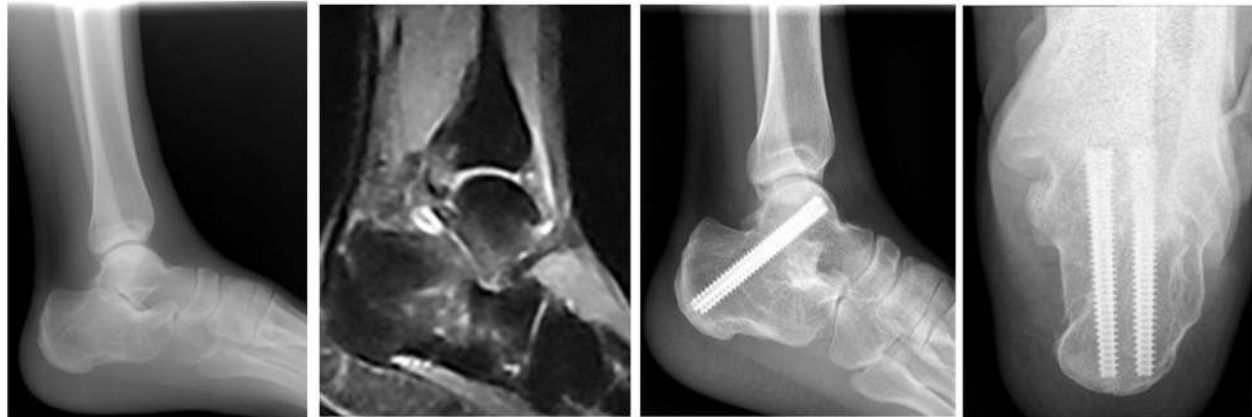
Fig. 4 This was a typical case: at 1 year after operation, bony fusion of the subtalar joint was realized, and bone trabeculae penetrated the subtalar joint with clear markings