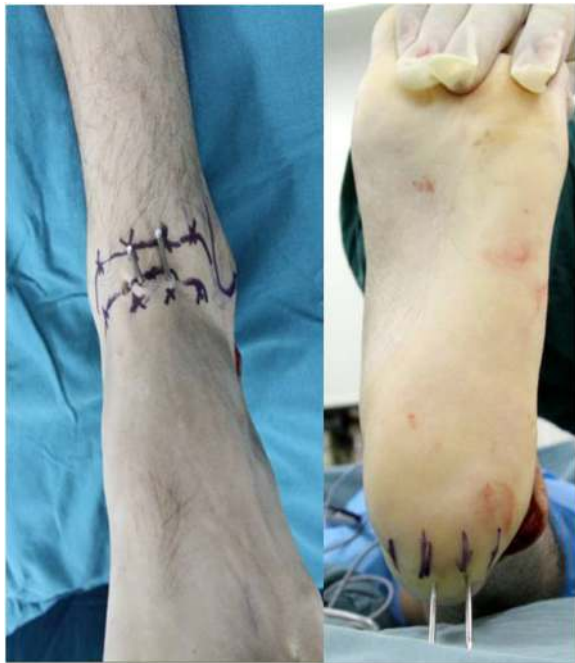
Fig. 1 The talar neck and posterior calcaneal tubercle were divided in triplicate transversally, and two guide wires were separately inserted from the talar neck into the posterior calcaneal tubercle in equal division points

into four levels: level 1, 90–100, excellent; level 2, 72–89, good; level 3, 41–71, medium; and level 4, 1–40, poor. The excellent and good results were satisfactory, and the medium and poor results were unsatisfactory. At 1 day, 6 weeks, 3 months, 6 months, 1 year, and thereafter every half a year after operation, X-ray examination was performed; CT examination were performed if the fusion could not be assessed by X-ray examination. The post-operative complications were observed.