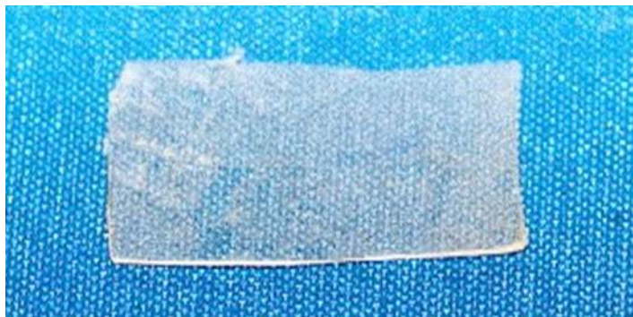
FIGURE 1 - Photograph of the polylysine latex biomembrane.

the tympanic membrane in contact with the temporalis fascia graft. The transitory implant rested on gelfoam and an otologic pomade containing polymixin and bacitracin. In group 1 patients, the graft was placed on gelfoam and the otologic pomade containing polymixin and bacitracin according to the standard tympanoplasty or myringoplasty technique (Figures 1 and 2).