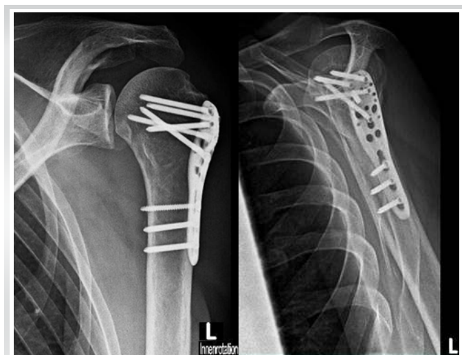
Figure 3: Radiographic examination in a.p. view (a: +internal rotation) and Neer view (b) showing osseous consolidation and anatomical alignment at 12-month follow-up.

SB – as used in this case – is a technical variant of the SutureBridge™ (Arthrex, Naples, Florida, USA) which uses two BioComposite SwiveLock™ anchors (Diameter 4.75 mm,