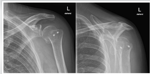
Figure 1: Radiographic examination in a.p. (a) and Neer view (b) showing an anatomical neck fracture of the proximal humerus (AO/OTA 11C1.3, Neer Type II) with a fracture line through the anchor site.