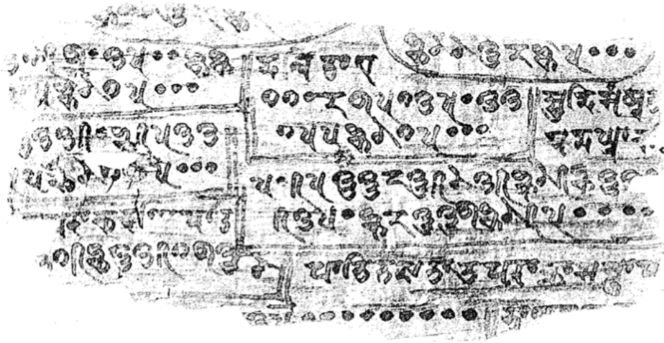
Figure 3: Fragment of Bakhshali manuscript with a portion of the square root calculation mentioned in Problem 1. For example, the large right-middle section corresponds to the fraction \frac{50753383762746743271936}{7250483394675000000} in Formula (4).