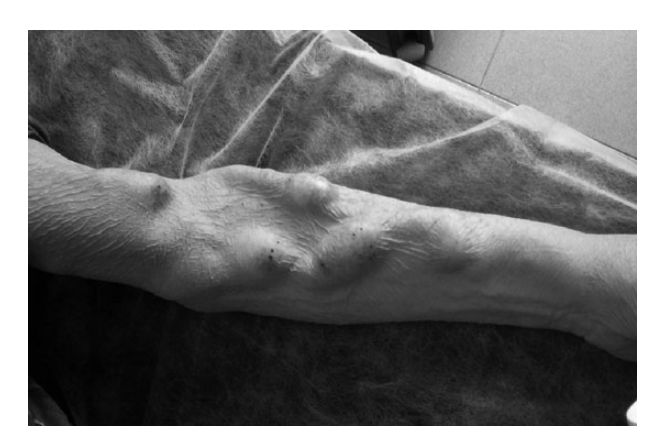
Fig. 1. Typical appearance of a longstanding mature distal radiocephalic AVF: the dilated cephalic vein is distended irregularly along its serpentine course and other draining veins are also dilated. The presence of localized aneurysmal dilatation can be seen at the sites of needling.

True aneurysms may be more difficult to define. The artery proximal to an AVF routinely dilates as it remodels in response to the increased blood flow [4]. The vein of an AVF typically increases in diameter greater than 3-fold to mature enough for needling. Most autologous in situ AVFs are often irregular and dilate asymmetrically (Figure 1). In practice, this is desirable and may give areas that facilitate needling; however, in classifying aneurysms and determining treatment, there is a requirement for clear definitions.