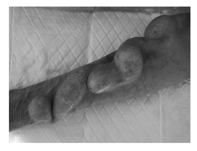
Fig. 4. A 10-year-old radiocephalic AVF: showing marked dilatation throughout but with excellent function and otherwise asymptomatic.

The risk of rupture of small stable aneurysms is low as they are thick walled and covered with skin. Clinical concerns are raised when an aneurysm presents with a rapid increase in size, pain, thinning and degeneration of the overlying skin and/or