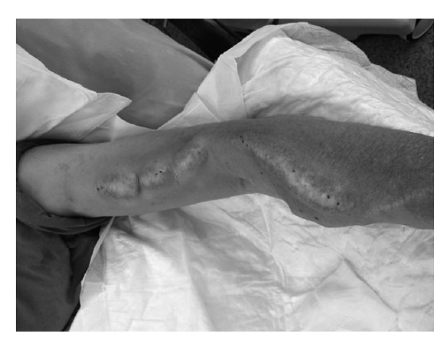
Fig. 3. Aneurysms in the site of repeated venipuncture: longstanding radiocephalic fistula with presence of aneurysms in the site of repeated venipuncture. The scares area from the needle sites are clearly visible.

The nature of the vessel wall may by implicated, and some patients may have a predisposition to aneurysm formation. This is seen in other aneurysms with connective tissue disorders [16], and higher aneurysm formation in VA has been described in Alport's syndrome [17]. Other disease states are associated with aneurysms elsewhere for example adult polycystic kidney disease, which is associated with intracerebral aneurysms, have been shown to increase the diameter of AVFs [6, 18]. Pregnancy is associated with aneurysm formation and splenic artery aneurysms although this is less frequent than is cited [19]. The role of this in VA is unreported, presumably due to the rarity of the situation.