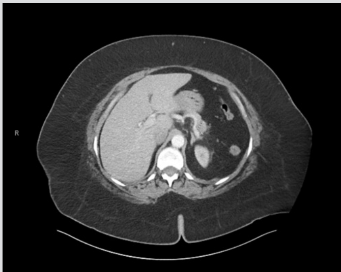
Figure 1. Computed tomography (CT) of the abdomen, revealing a 1.5 cm hypodensity in the pancreatic body consistent with a pseudocyst

A 63-year old woman presented to our emergency department (ED) with a 7-day history of abdominal pain, nausea and anorexia (index admission). Her history included hypertension, diabetes, hyperlipidaemia, asthma and obesity. She was compliant on lisinopril 40 mg, atenolol 50 mg, hydrochlorothiazide (HCTZ) 25 mg, simvastatin 20 mg, ipratropium and insulin. She denied similar previous episodes or symptoms and did not use alcohol. She was haemodynamically stable, and physical examination only showed epigastric tenderness. Laboratory work-up revealed elevated lipase levels, consistent with acute pancreatitis. Hydration, analgesia and anti-emetics were given. Right upper quadrant ultrasound revealed no biliary pathology, while computed tomography (CT) and magnetic resonance cholangiopancreatography (MRCP) revealed a pseudocyst (Figs. 1 and 2), which had not been seen on previous abdominal imaging. The gastroenterology department was consulted and assisted in completing extensive haematological, metabolic, lipid and autoimmune profiling, which was negative.